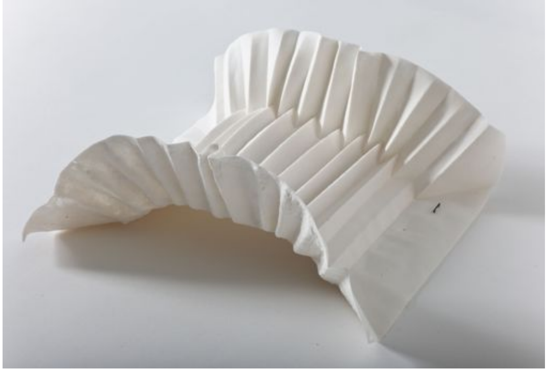
"we will cross that bridge when we get there" (porcelain, 40x25x10cm)