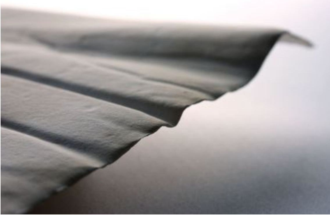
...Crease the web of the world... if only once... (porcelain, 20x15cm, 20x18cm)