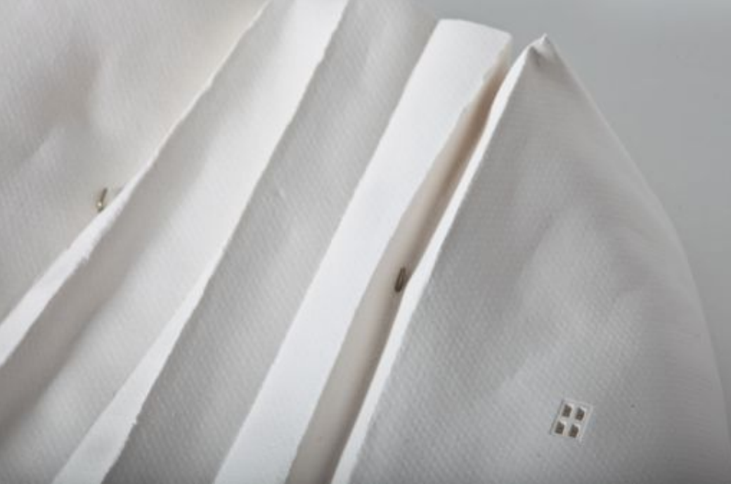
...you are either so high up that I cannot reach you or so deep down that I cannot see you... (porcelain, 35×45×8cm)