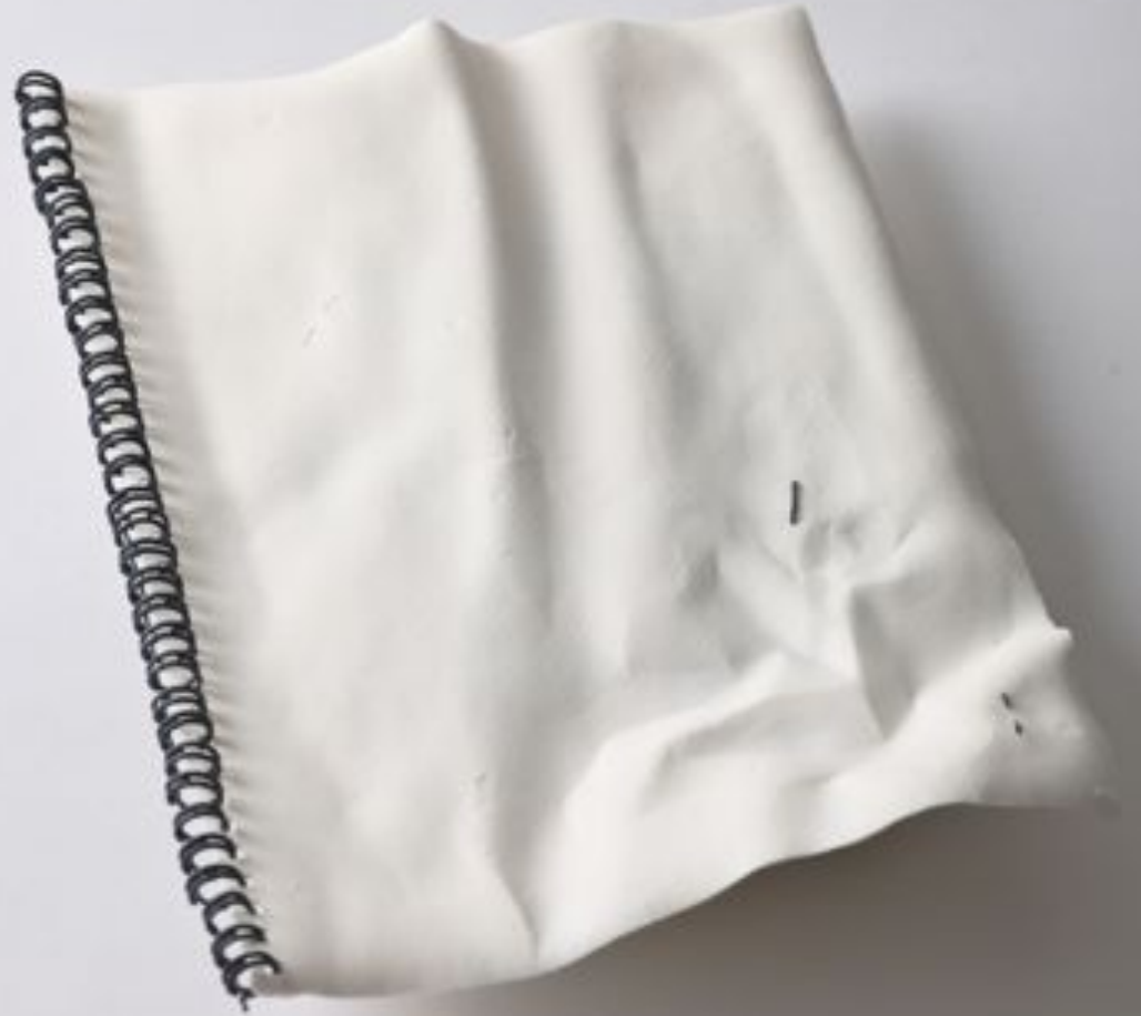
...Crease the web of the world.. if only once... (porcelain, 20x12x2cm, 26x18x2cm)